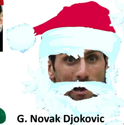
G. Novak Djokovic