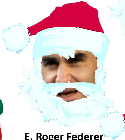
E. Roger Federer