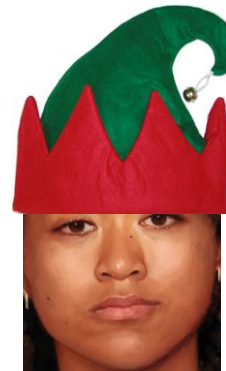
J. Naomi Osaka