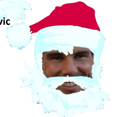
L. Rafael Nadal