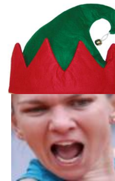
K. Simona Halep