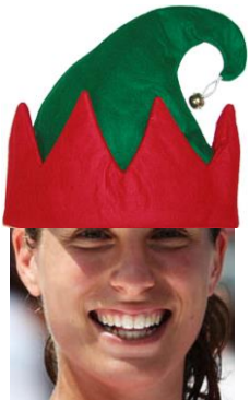
H. Johanna Konta